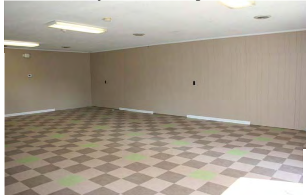
(Inside the girl's dorm- sleeping area)