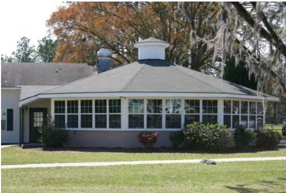
(They will begin the new roof this week)

As you well know, we have been busy upgrading our Camp's Facilities. They look great and we are getting closer to the end of this project. Thank the Lord for that! Here are a couple shots of the improvements being done.