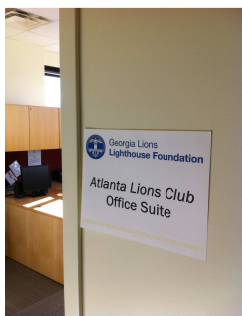
Left We have our own room dedicated to the Atlanta Lions Club