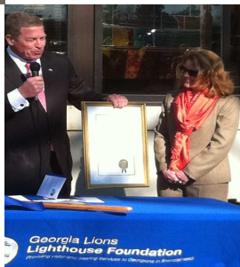
Left The Lighthouse receives a proclamation from the Georgia House of Representatives