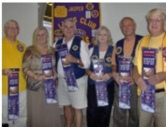
Jasper Lions presenting flags to the members from Ball Ground