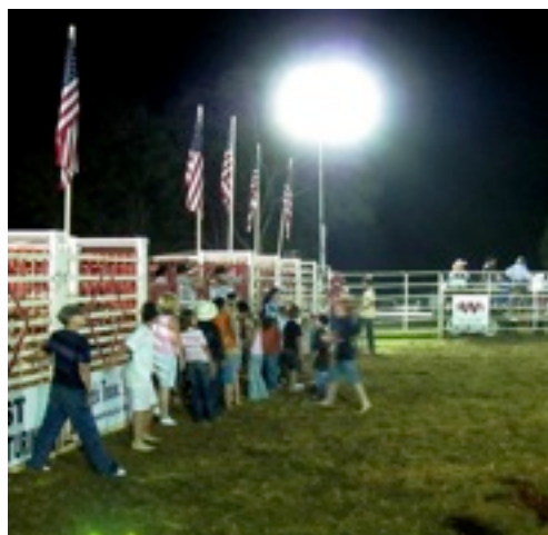
Some of the children who participated in the Boot Scramble. The winner received $25.