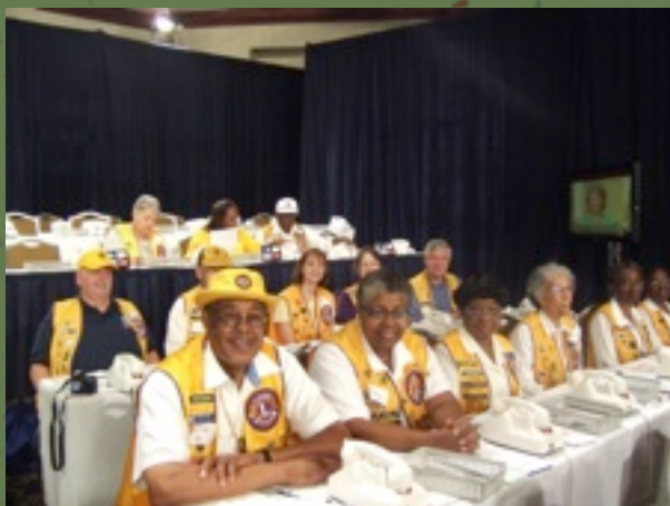
18 Lions ready to accept donations for Jerry's Kids

Twenty-six Lions from Atlanta Metro, Cartersville, East Cobb, Kennesaw-Acworth, Sandy Springs, and West Cobb helped man the phones at the Jerry Lewis Telethon to benefit Muscular Dystrophy. The Telethon was held on Labor Day.