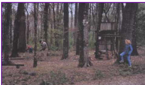
Pictures taken during the Camp for the Blind Work Weekend March 26-28, 2010

Lions from all over the State have approached me asking