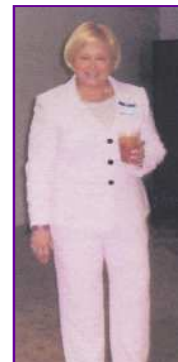
Commissioner Bebe Heiskel