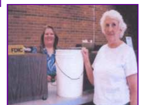
Bucket of Money from the Road Block