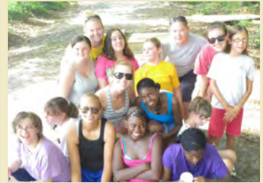
Smile! You're at GLCB!!