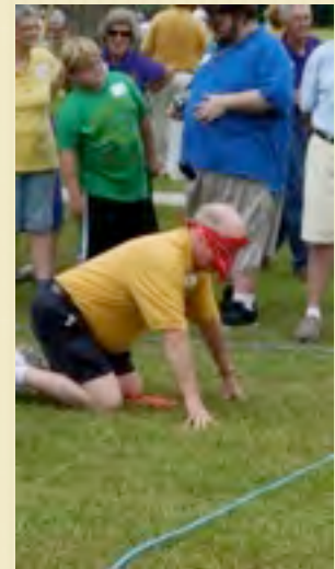
Below: Beeper Ball